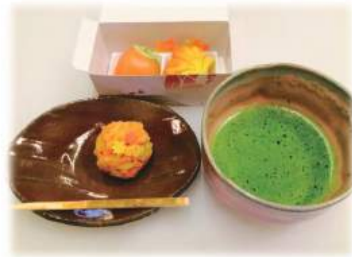
1.Hoshi-gashi (干菓子) 2.Persimmon shaped Jo-namagashi(柿の形の上生菓子) 3.Jo-namagashi with minced bean paste(そぼろ餡の上生菓子)